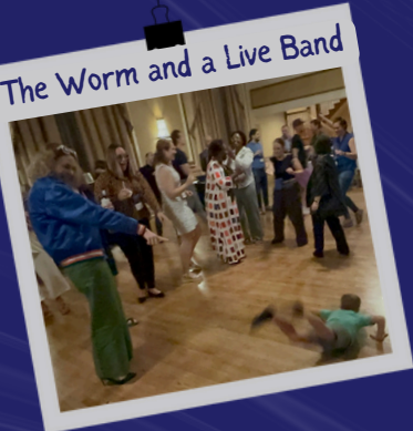
The Worm and a Live Band