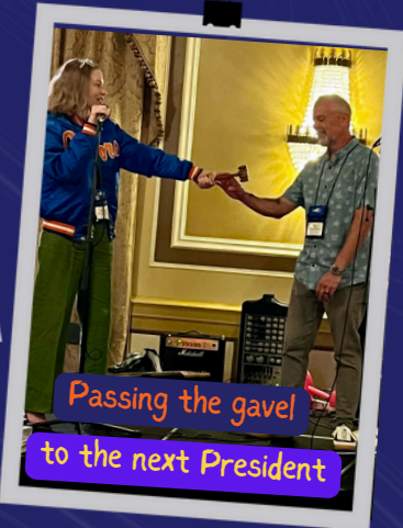
Passing the gavel to the next President