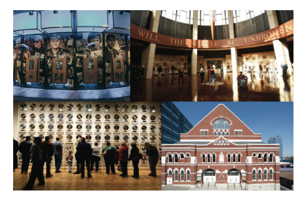
September 10-13 in the DoubleTree by Hilton in downtown Nashville, Tennessee.

Enjoy networking, numerous receptions, student opportunities, and special panels!